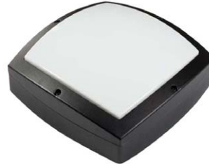
OF Open Face