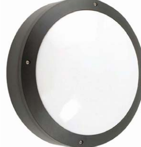
OF Open Face